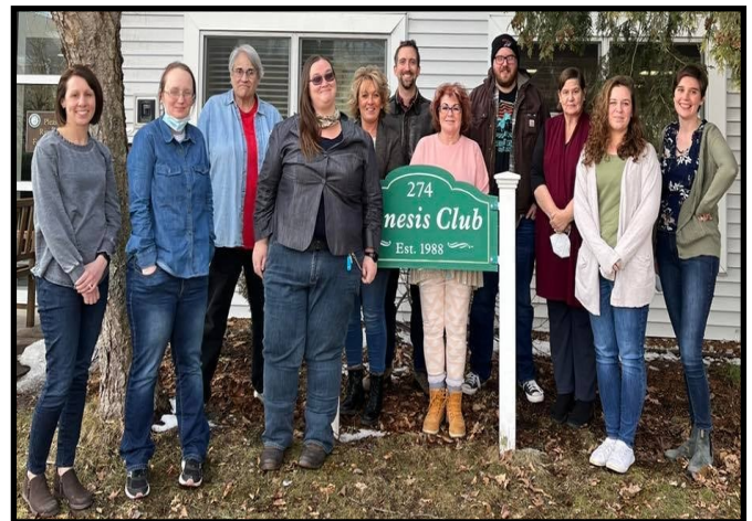
Colleagues from Capitol Clubhouse, High Hopes Clubhouse and Circle City Clubhouse (Indianapolis, Indiana) at Genesis Clubhouse in Worcester, Mass.