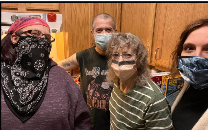
Mobile Reachout for our amazing members unable to attend.