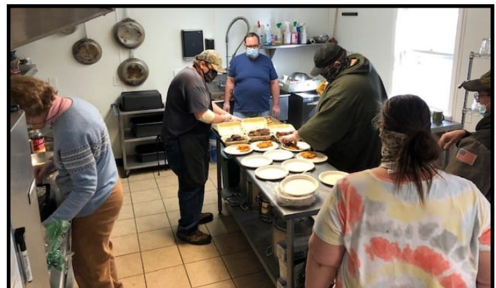
The kitchen crew hard at working preparing lunch.