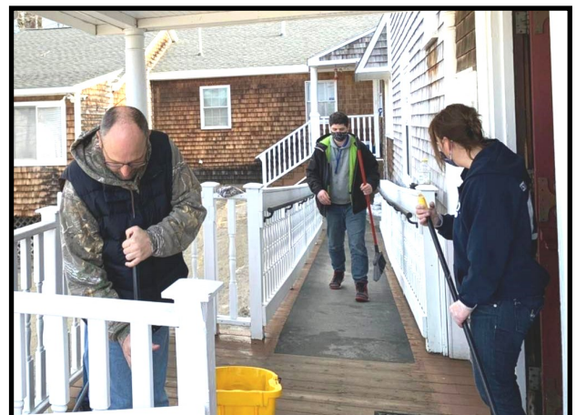
Starting outside spring cleaning early!